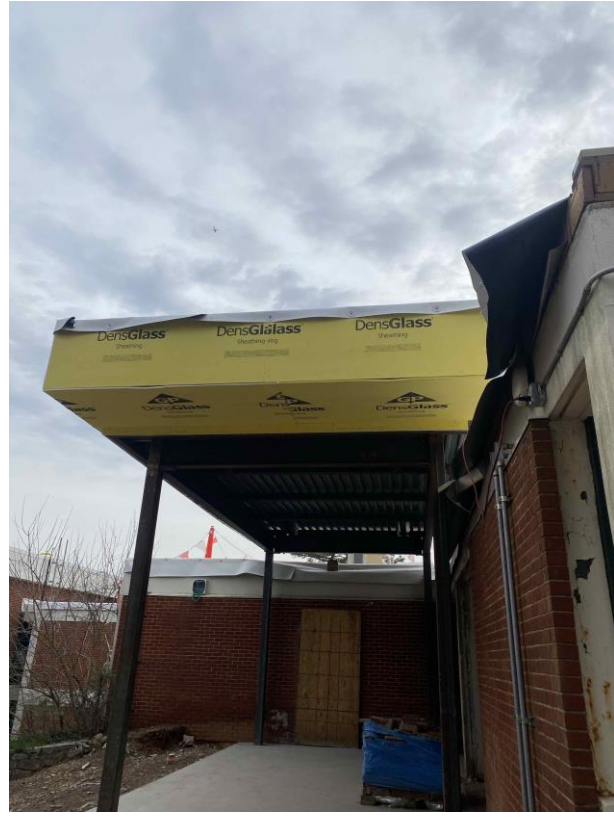
Sheathing at security vestibule